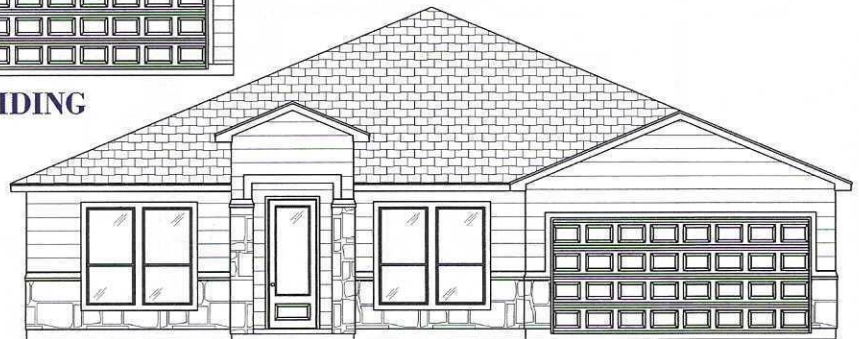
ELEVATION A - HARDI & STONE $2,500 (FRONT)