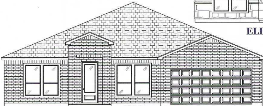
ELEVATION B - BRICK $5,200 (FRONT)