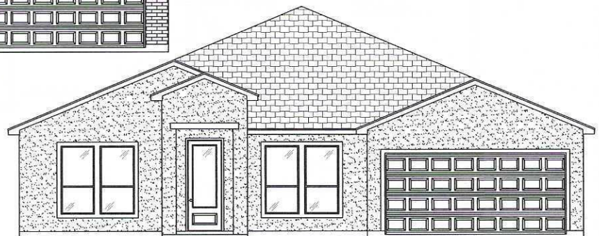
ELEVATION C - STUCCO $4,300 (FRONT)